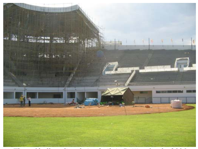
The softball stadium being built in Beijing for the 2006 Women's World Championship & 2008 Olympic Games.

Visit the official website of the 2006 ISF Women's World Championship at <a href="https://www.2006softball.org">www.2006softball.org</a>