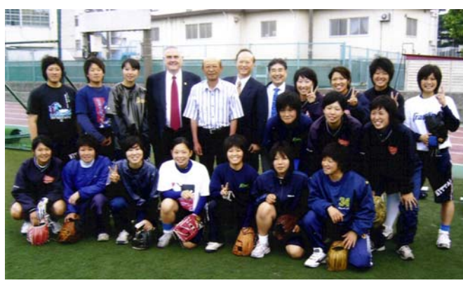
The softball officials pose with a softball team at Tokyo University, where a field test was being conducted of a new ball that Mizuno is developing for the ISF.