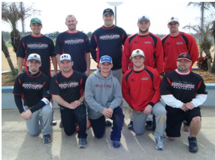
OUTKAST FROM TENNESSEE - CHAMPIONS