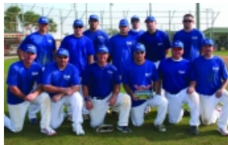
Russell's Paint & Body