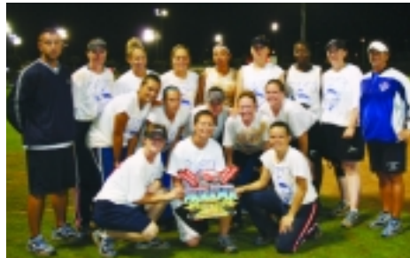
Doc's Lady Softball Softies