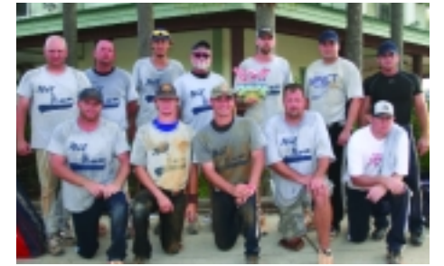
Hit & Run