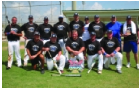
Gutterworks/Tint on Wheels/3N2 Sports/Easton