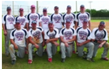
Willow River Saloon/Village Inn/Fleet Feet