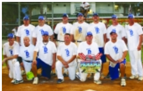
Just 1 More

In the Men's B, it was Rope Masters who took the championship finals game over Eagle Bonding 19-7 for the win. Rope Masters defeated Chain Gang, All Army and EWS/SNL/Boombah to get to the final game. Runners-up Eagle Bonding fought their way to make it to the 'ship by beating Deep South/The Scene and losing the next game to EWS/SNL/Boombah by one run 29-28 sending them to the losers' bracket. Eagle Bonding bowed up and took care of Chargers/Worth, Team Kongo/Navy, All