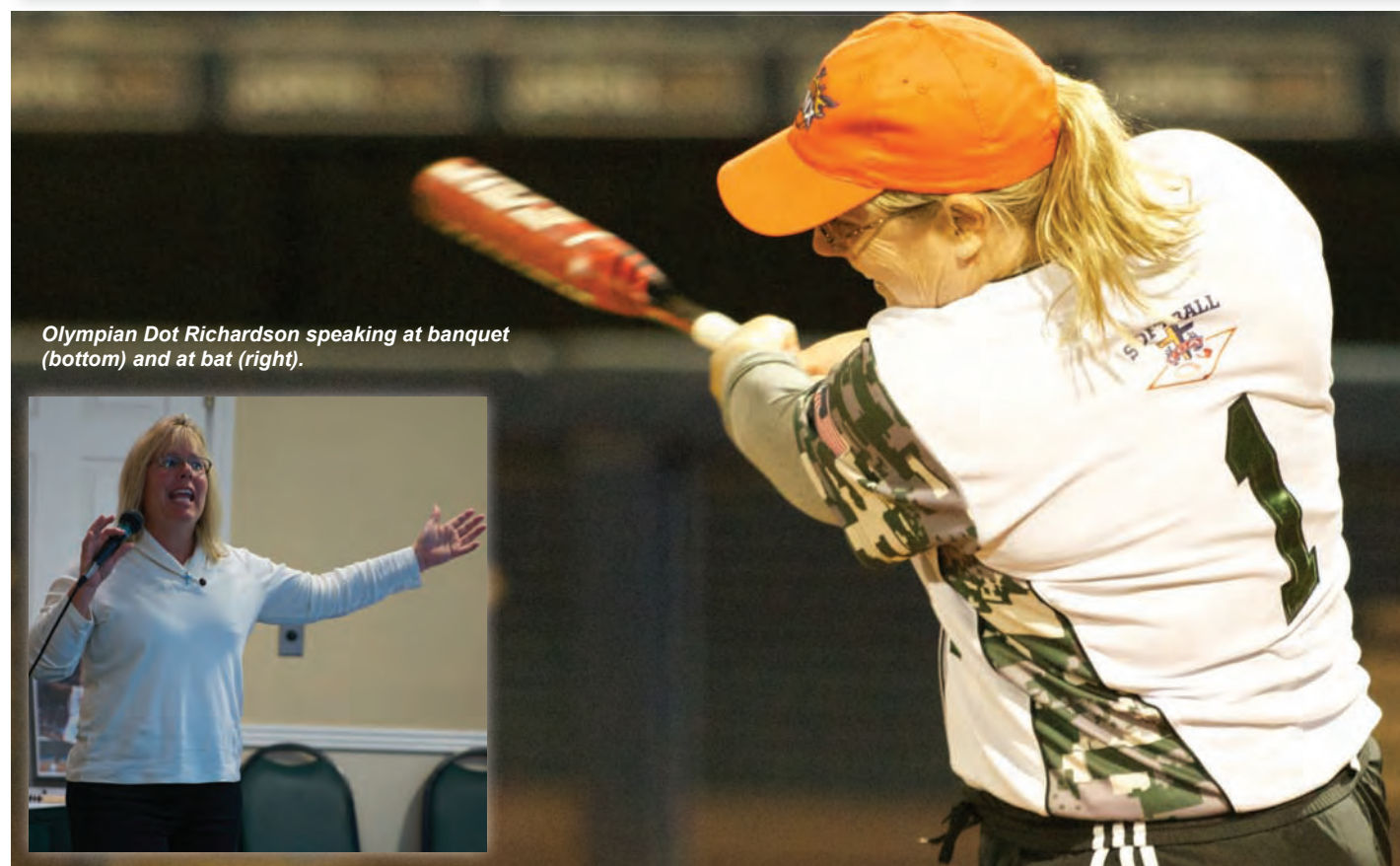
Olympian Dot Richardson speaking at banquet (bottom) and at bat (right).