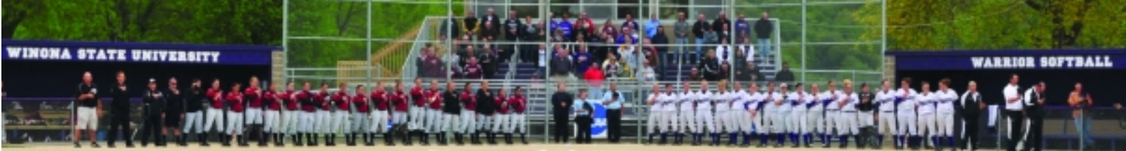
A panoramic view of Winona, MN and Alumni Field during the playing of the national anthem of Game Two to the NCAA Division II Super Region 3 Tournament.