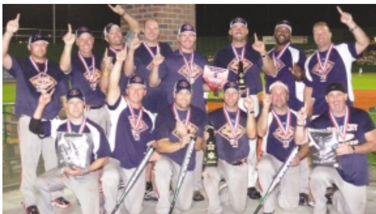
Motor City Blues