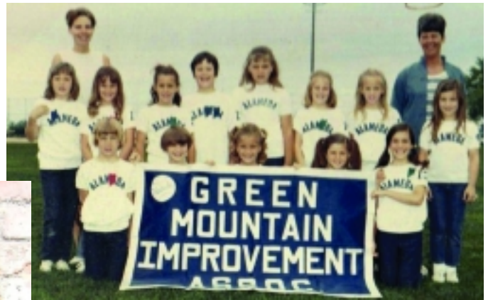
Above: "My first softball team. I'm the one fourth from the left in the back row. The coach with dark hair is my Mom!"